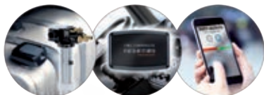
FUEL CONTROLLER Complete fuel management hardware