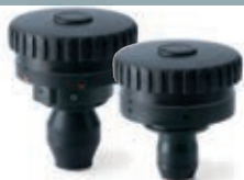
KOCKÒN MACH II Modular anti siphon devices